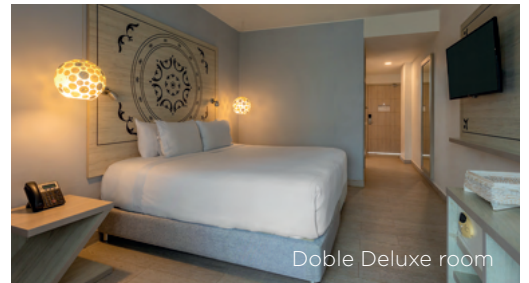
Doble Deluxe room

Maximum capacity: 3 adults or 2 adults + 1 child (sharing beds) Area: 24 m 2 (258 ft 2 )