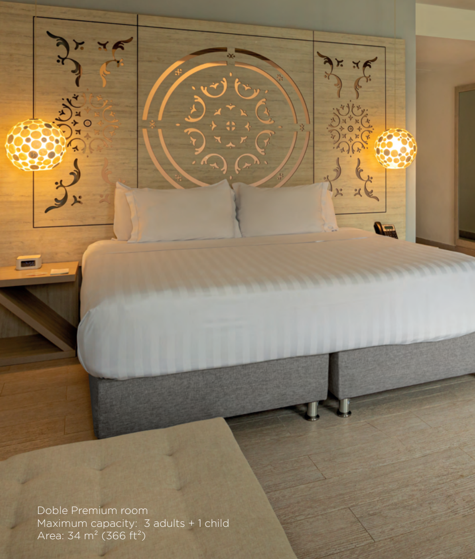
Doble Premium room Maximum capacity: 3 adults + 1 child Area: 34 m 2 (366 ft 2 )